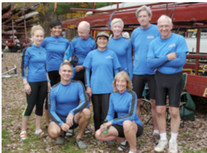
HoF Mixed Eight