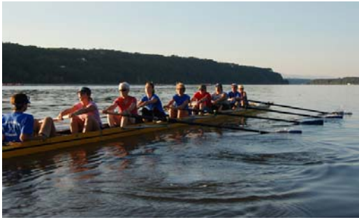
Mid Hudson Rowing Association Adult Learn to Row Programs